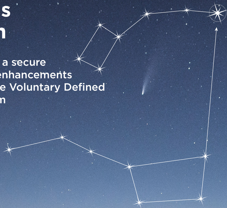
Chart your course to a secure retirement with the enhancements to the New York State Voluntary Defined Contribution Program